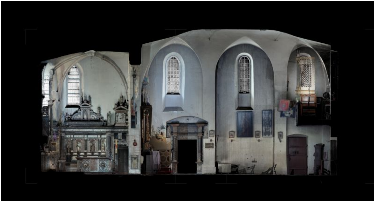
Fig. 2. Cracow, St Giles' church, longitudinal section showing the south wall; measurements and modelling: ArchiTube (© Uniwersytet Jagielloński)