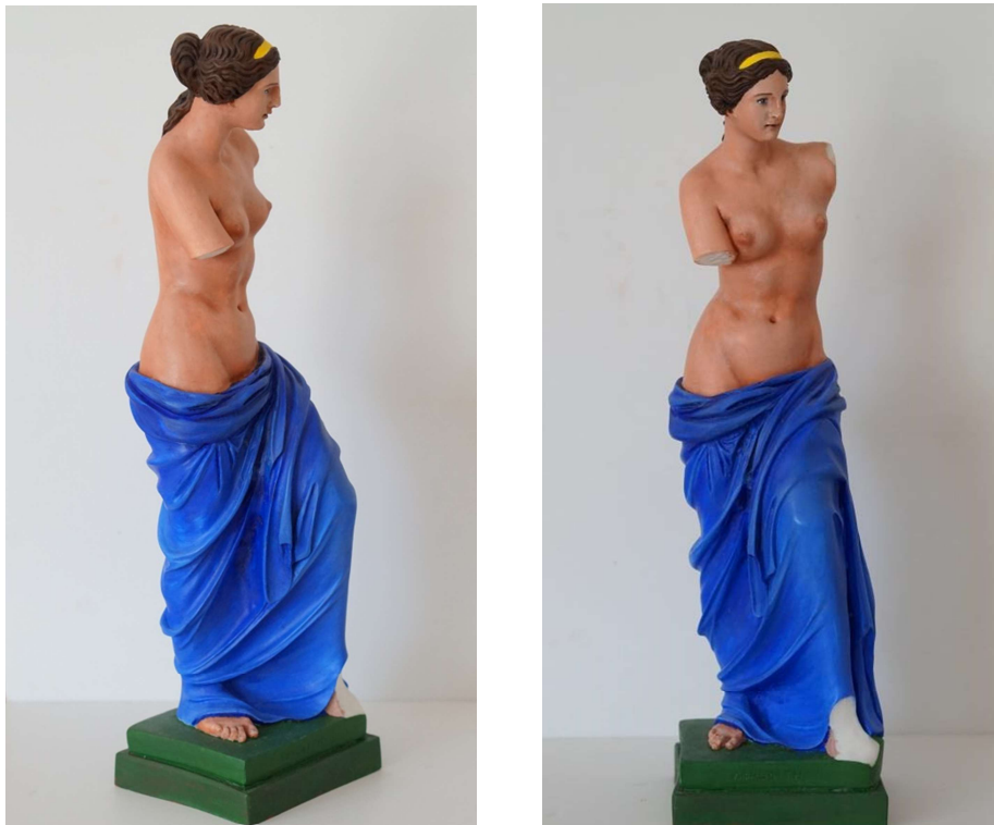
Fig. 2. Reconstruction of Venus de Milo in colour (© K. Mann)

Therefore, hypothetical reconstructions are interesting for these ancient sculptures, which are very important for our cultural memory, such as the Laocoön group, the Apollo Belvedere or the Venus de Milo.