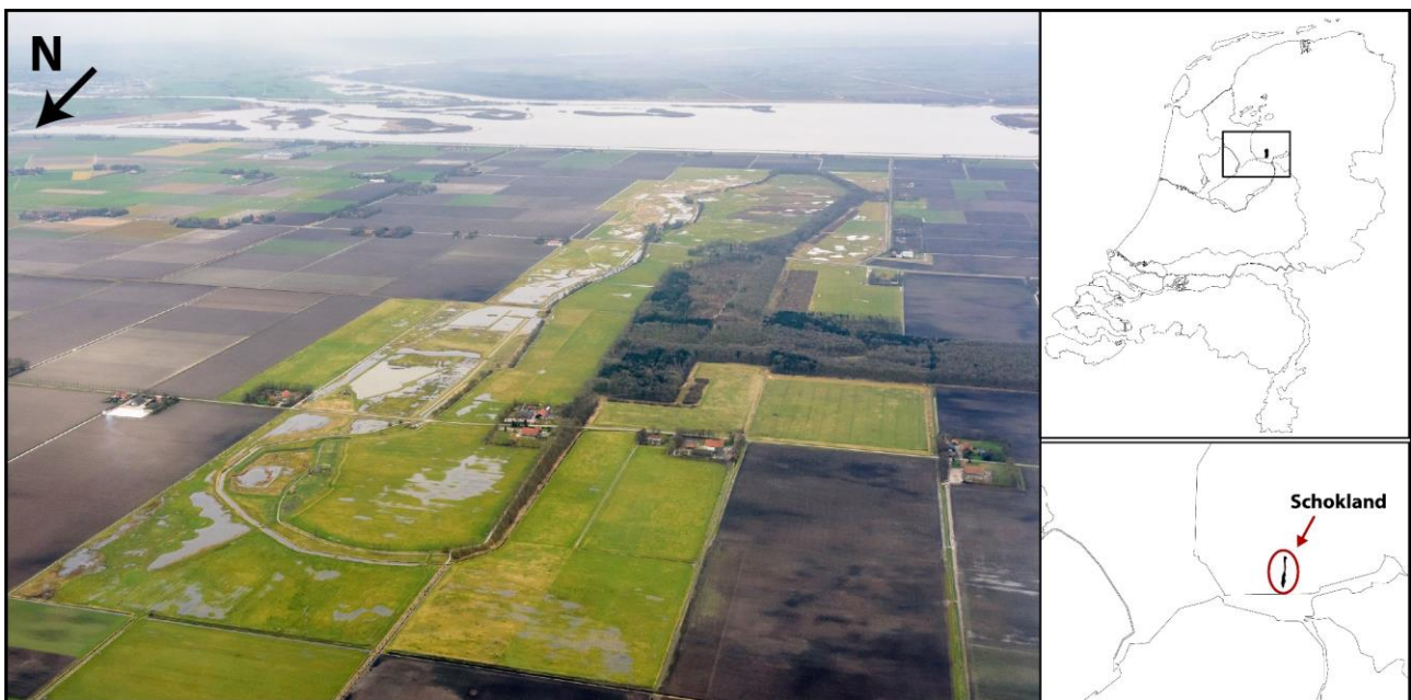
Figure 1: Left: The contours of the former island of Schokland are still clearly visible in the modern-day reclaimed landscape (viewed from the north. Aerial photograph by: Jan Willem Schoonhoven, Wikimedia). Right: the location of Schokland within the present-day Netherlands on two zoom levels.

In this contribution we present such a new tooling: a Historical Geographical Information System (HGIS) specifically designed to manage, study, and contextualize the world-heritage site of Schokland (NL; Fig. 1). This world-heritage site is characterized by a long-term history of human-landscape interaction within a highly dynamic landscape setting resulting in a complex layeredness of the landscape. We will show that (1) the HGIS and HGIS-methodology facilitates a flexible information management system which is essential for heritage conservation in dynamic areas, (2) the system greatly adds to the digital accessibility of the site, (3) allows to unravel the historical complexity of landscapes, and (4) supports integrated approaches towards mapping and analysing cultural and natural factors surrounding heritage sites. Based on our results we will argue that differentiating between culture and nature, even at a 'culturally-classified' world-heritage site, often only hampers sustainable preservation.