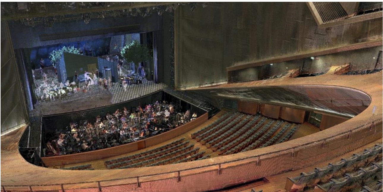
Fig. 1. Panoramic view of the colored point cloud of the interiors of the main hall

The overall point cloud was rendered through the acquisition of 177 color scans using a Z+F 5016 laser scanner, and 109 scans made with the Faro Focus M70. The data acquired, recorded using the Leica Cyclone software, produced a colored point cloud of the entire complex (Fig. 1) and the surrounding environment, well balanced in the representation of the original color of the elements and therefore highly descriptive (Cioli and Ricci, 2020).