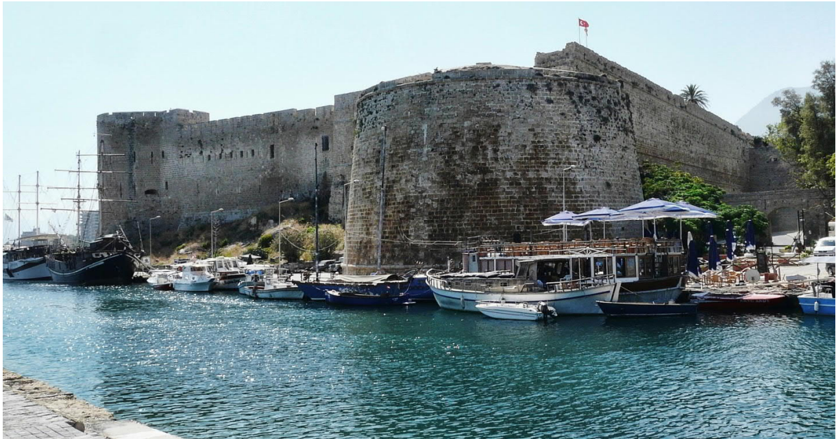
Fig. 1. View of the Kyrenia Castle from the harbour