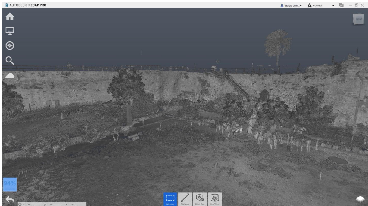
Fig. 4. The aligned point-cloud from the 3D Laser Scanner survey in Autodesk Recap