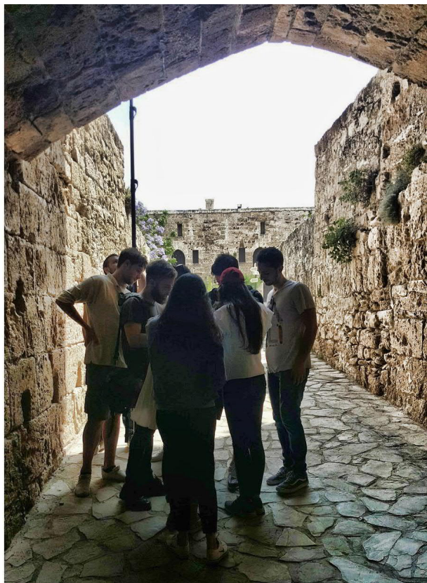
Fig. 2. A group of participants to the workshop working with the 3D Eye unit