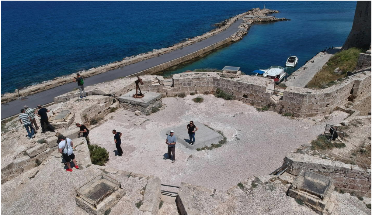
Fig. 3. Operations with the drone on the walls of the Kyrenia Castle