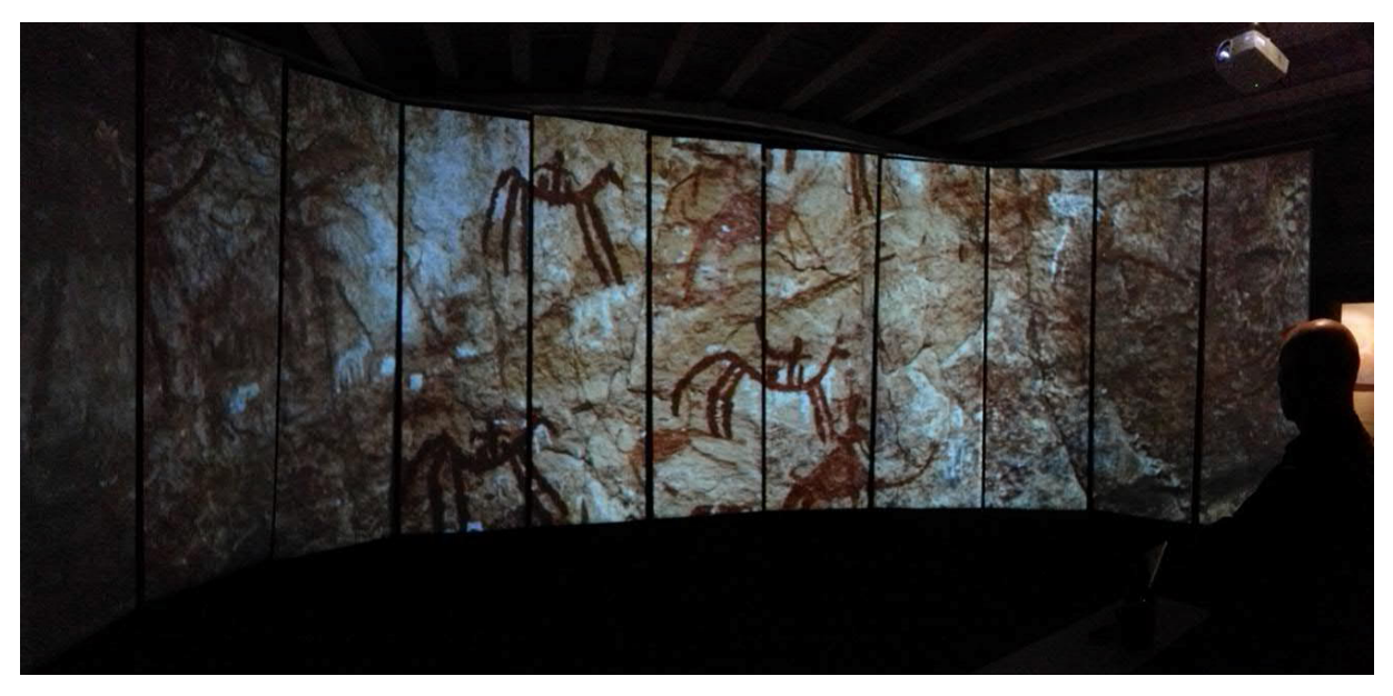
Fig. 5. The immersive section of the exhibition "The fragility of the sign" (©IIPP)