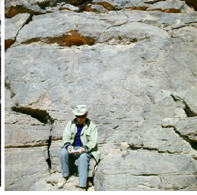
Fig. 2. Paolo Graziosi, the founder of the IIPP, collecting pictures and data in two different missions in Libya a) 1938, Ghira, Fezzan, AFIIPP 3069; b) 1968, Tilizzaghen, Libya, AFIIPP 5706