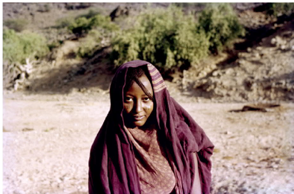
Fig. 3. A young girl in Riccab, Eritrea, 1961, AFIIPP 3491 left: Scan of the original photo; right: After the digital restoration

The project consists of two different phases. In the first phase, focused on conservation, the whole group of images related to Africa was digitized in high definition. About 3000 images were scanned (2500 dpi) following the standards given by the "Italian Institute of Union Catalogue" (ICCU), using an Epson Perfection V850 Pro scanner and the software Silverlight. After that, a digital restoration of a first group of 250 slides and photographs was carried out. The restoration consisted in reconstructing the original colours of the films and in removing the traces of mould, scratches, and dust, using the image editing software Adobe Photoshop CC (Fig. 3). The first operation consisted in the elimination of the frame, followed by correction of the color balance, to offset the deterioration caused by the chromatic alteration. Lastly, scratches, cuts and traces of dust where removed from the film mainly using the clone tool. The footage of the archive has been digitized and restored thanks to the collaboration with the University of Florence. The real scale graphic reliefs on paper were also inventoried and photographed. The original pieces were in a precarious state of conservation and therefore they were rolled in non-acid paper to ensure their conservation, awaiting proper intervention.