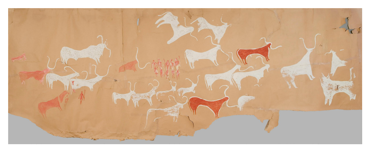
Fig. 4. Real scale relief of a rock art painting sited in Carora – Eritrea (312x115 cm) made with pencil and tempera on paper during a mission directed by Paolo Graziosi.

into Eritrean and Somali rock art paintings and engravings thanks to the reproduction of three real scale reliefs of the Horn of Africa. The presentation was enriched with two monitors with sliding images and footages of Paolo Graziosi's missions with an ethnographic and anthropological perspective. In the last space, the visitors were surrounded by evocative sounds and an immersive projection (Fig. 5), showing animations, images and footage of great suggestion about rock art and the ethnographic research in Libya made by Graziosi. The immersive presentation used the pictures of the prehistoric rock art representing engravings and paintings of man and animals as a starting layer over which multiple lines emphasized the contours of the subjects.